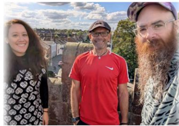
Trio of local parents who formed trust become finalists in bid to take over historic library building as they believe 'everyone has a story' Three locals who first met picking their children up from nursery have teamed up in a bid to "save the library for the people of the town".

At the moment they are only raising awareness, and looking for people who are interested to sign up to our newsletter and follow them on social media. If you are interested to find out more, please visit their social media pages, links below and sign up to their newsletter.